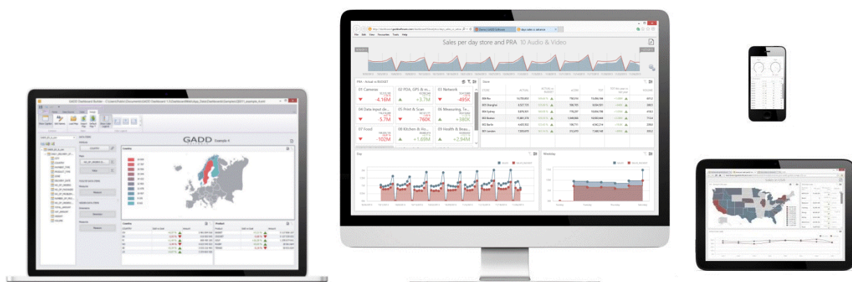
GADD Dashboards available on any device via web browser.

For making the dashboards available on your Intranet or via Internet you need the GADD Dashboard Server.