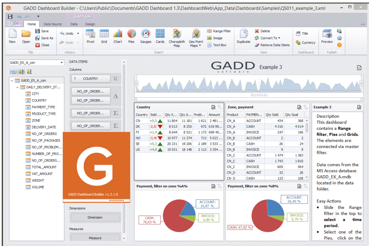
GADD Dashboards Builder to create dashboards.